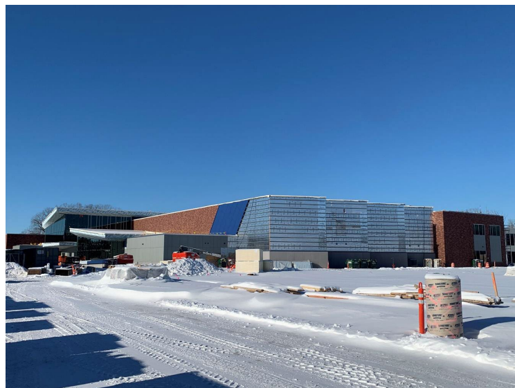
View of the southeast side of the school where composite wall panel installation is in progress.