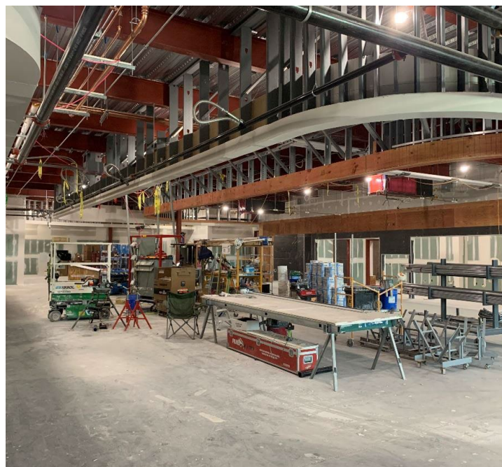
Gyp board taping and mudding in the first-floor flex café is in progress.