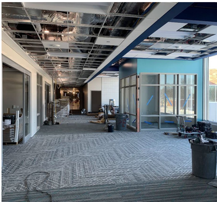
Carpeting and sliding glass doors are in place on the second floor.