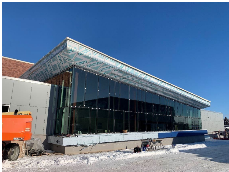
Metal girt system and metal coping installation is progressing.